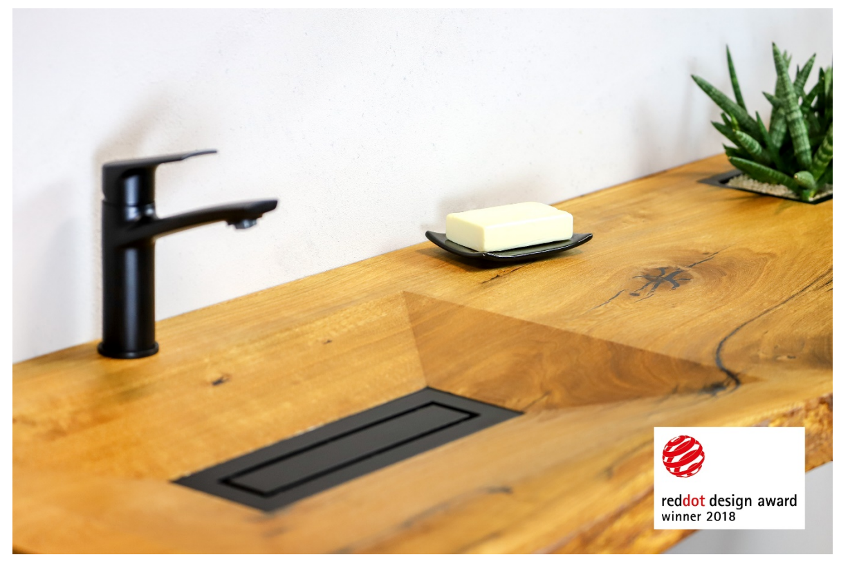
Title: The surface of the award-winning wooden washbasin was treated with OLI-NATURA HS 2C Profiöl