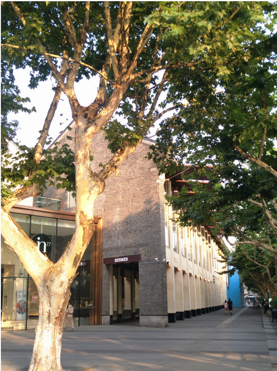
Title: Store of the luxury label on the trendy promenade along the West Lake in Hangzhou