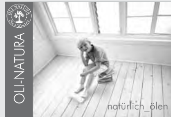
Professional oils and waxes for indoors and outdoors

Visit us at www.oli-lacke.com and www.oli-natura.de