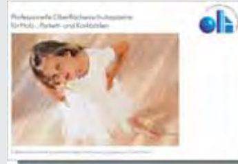
Professional surface protection systems for wooden, parquet and cork floors