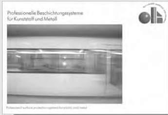
Professional coating systems for synthetics and metal