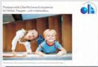
Professional surface protection systems for furniture, stairs and interior woodwork