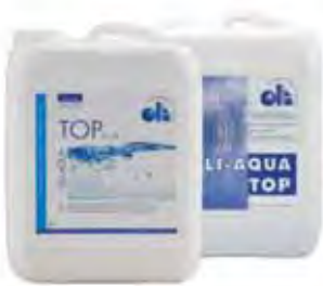
New and old label

facelift in the first half of the year 2009. We let our visitors at the DOMOTEX vote on how exactly they will look like in the future! They have the choice between the current label and two new alternatives.